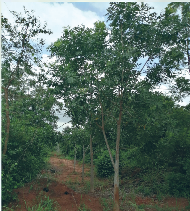
Figure 7: Enrichment planting site within the Achimota Forest Reserve – Greater Accra Region