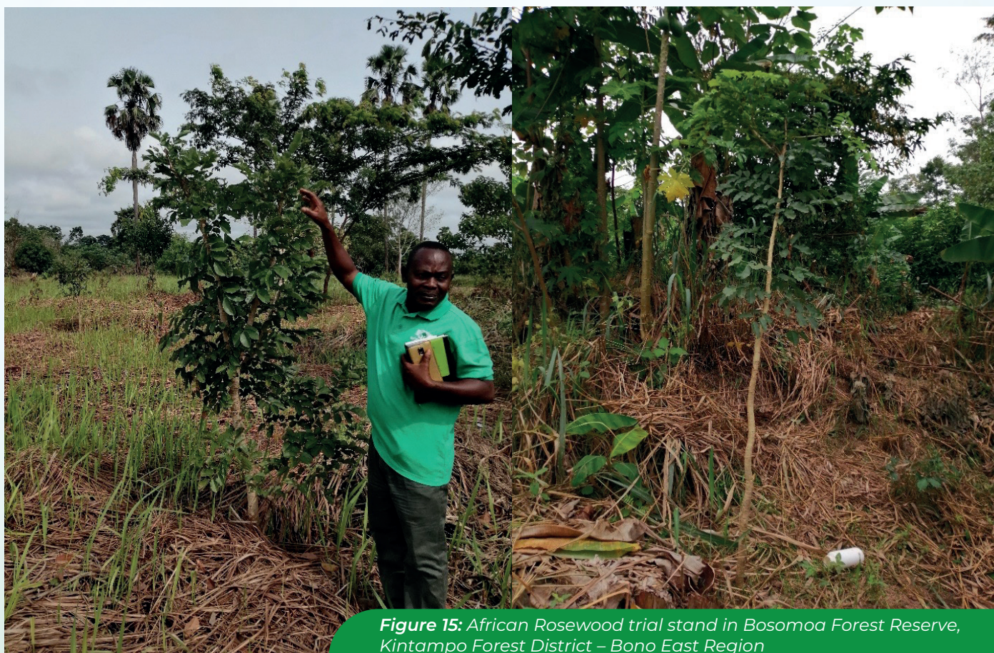
Figure 15: African Rosewood trial stand in Bosomoa Forest Reserve, Kintampo Forest District – Bono East Region