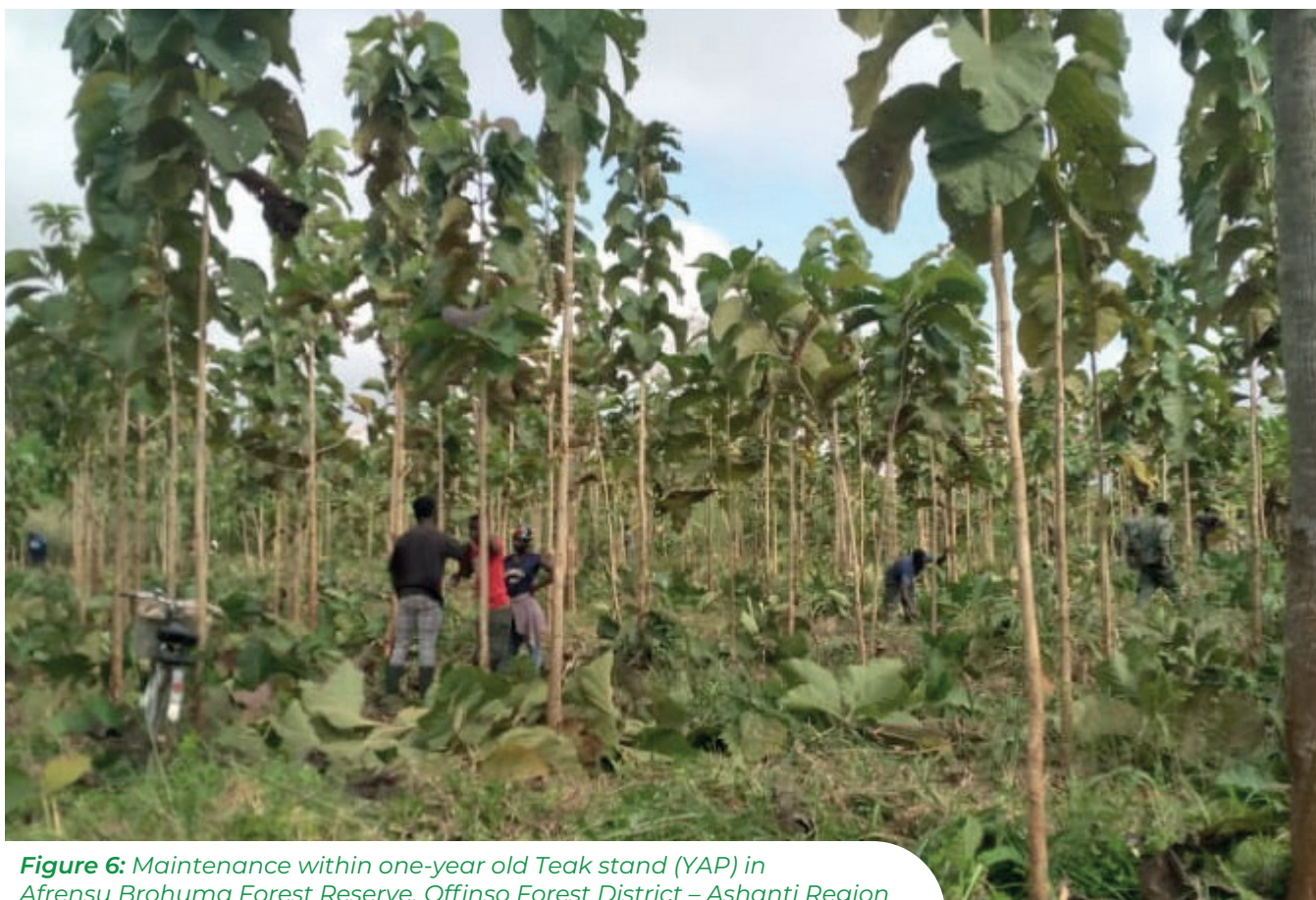
Figure 6: Maintenance within one-year old Teak stand (YAP) in Afrensu Brohuma Forest Reserve, Offinso Forest District – Ashanti Region

During the reporting period, various maintenance activities were undertaken within existing plantations to ensure optimal growth and yield. Maintenance and forest protection activities undertaken in forest plantations include weeding, pruning, thinning, as well as protection of the plantations from wildfire, pests and diseases. In addition, severely burnt/ disturbed forest plantations were also rehabilitated through extensive beating up. A total area of 45,125.2 ha of forest plantations was maintained in 2020. The maintenance activities were undertaken within forest plantations established under the following planting components outlined in Table 9: