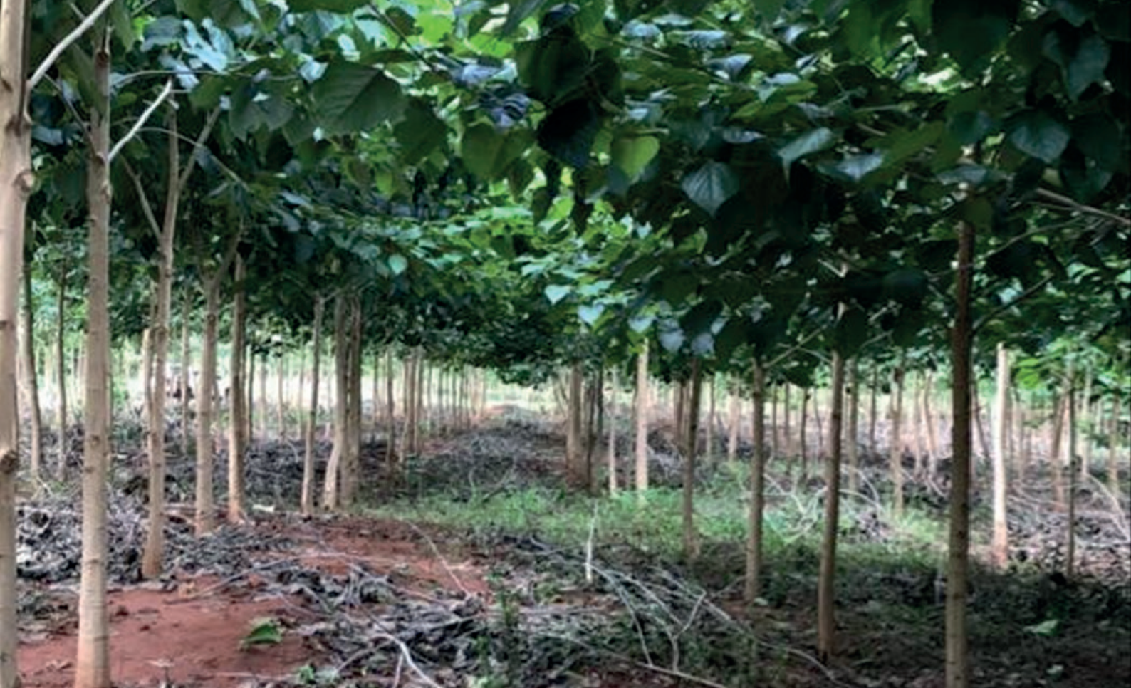
Figure 4: 13-month old Gmelina stand established by Miro Forestry (Ch) Limited in Boumfum Forest Reserve, Kumawu Forest District- Ashanti Region.