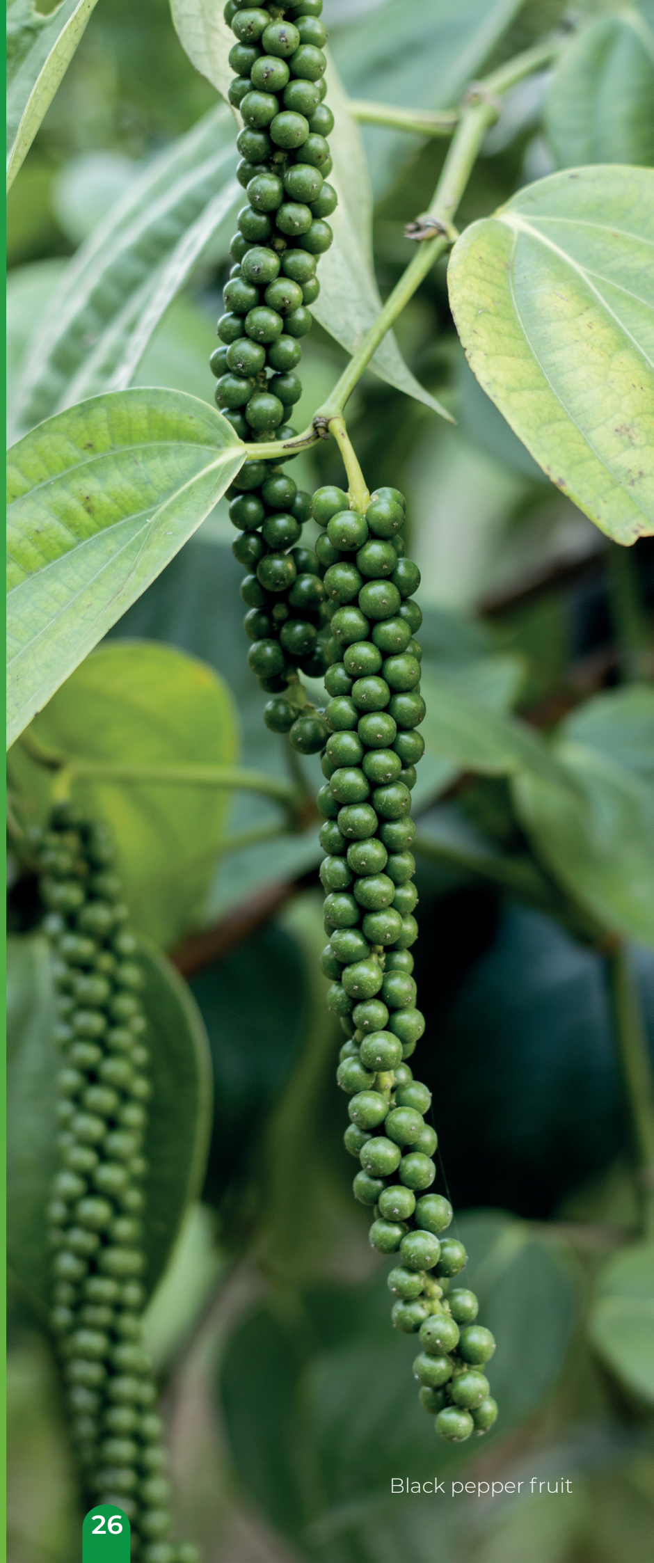
Black pepper fruit

As part of the post NWO ARF WOTRO Project activities, a team from RMSC trained some of the Nyamebekyere No.3 community farmers (Unity Black Pepper Growers Association) at Mankranso in the processing of raw black pepper into powdery form, packaging and labelling of the products. Products (both grains and powder) from the project were exhibited at a conference in the Netherlands at the request of the NWO-WOTRO Science for Global Development for NTFPs (Grains of paradise, black pepper and honey) team. The NTFPs were thus collected from the project sites at Akwaburaso and Mankranso. Subsequently, the NWO ARF WOTRO Tree Farm Project activities are being mainstreamed into RMSC activities.