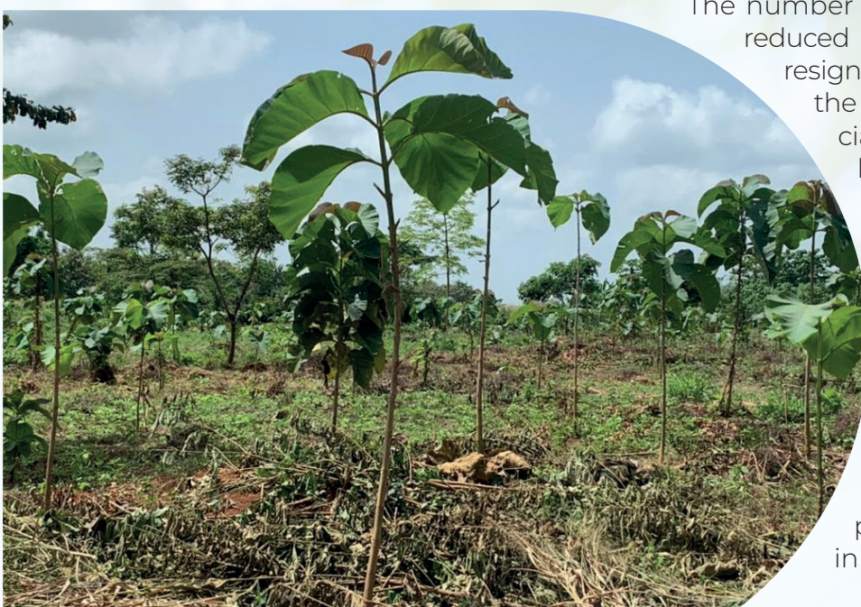
Figure 1: 2020 YAP plantation stand in the Afrensu Brohuma Forest Reserve, Offinso Forest District – Ashanti Region

The Youth in Afforestation/Reforestation Project (YAP) is a government-funded forest plantation development project which engages the youth to undertake rehabilitation of degraded and deforested landscapes nationwide, raise tree seedlings and also support forest protection and management measures. Implementation of the project commenced in April 2018 with an initial engagement of about 50,000 beneficiaries.