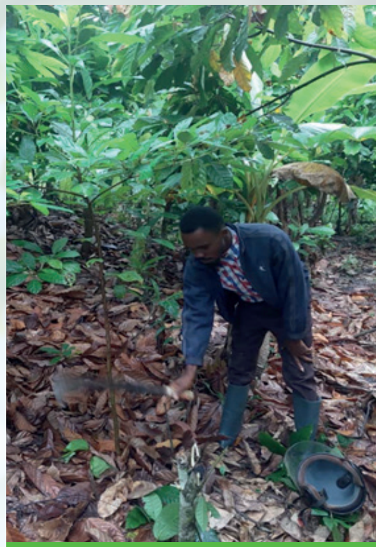
Figure 9: Ofram tree planted in a cocoa farm at Acherensua, Bechem Forest District – Ahafo Region

During the reporting period, the trees-on-farm intervention was implemented under the Tain II Landscape Restoration Project, YAP and through the efforts of other actors (e.g. Ghana Cocoa Board, Private Sector and Civil Society Organisations) targeted at promoting climate smart agriculture. In total, 5,010,261 tree seedlings were reported supplied to farmers for planting in their farms (Table 11). The trees were either planted within the farms (usually about 18 – 21 trees per hectare) or planted along the boundaries of farms (about 132 trees per hectare). An estimated area of 150,307.8 ha of farms (predominantly cocoa farms) was covered under this intervention in 2020. The details are as follows: