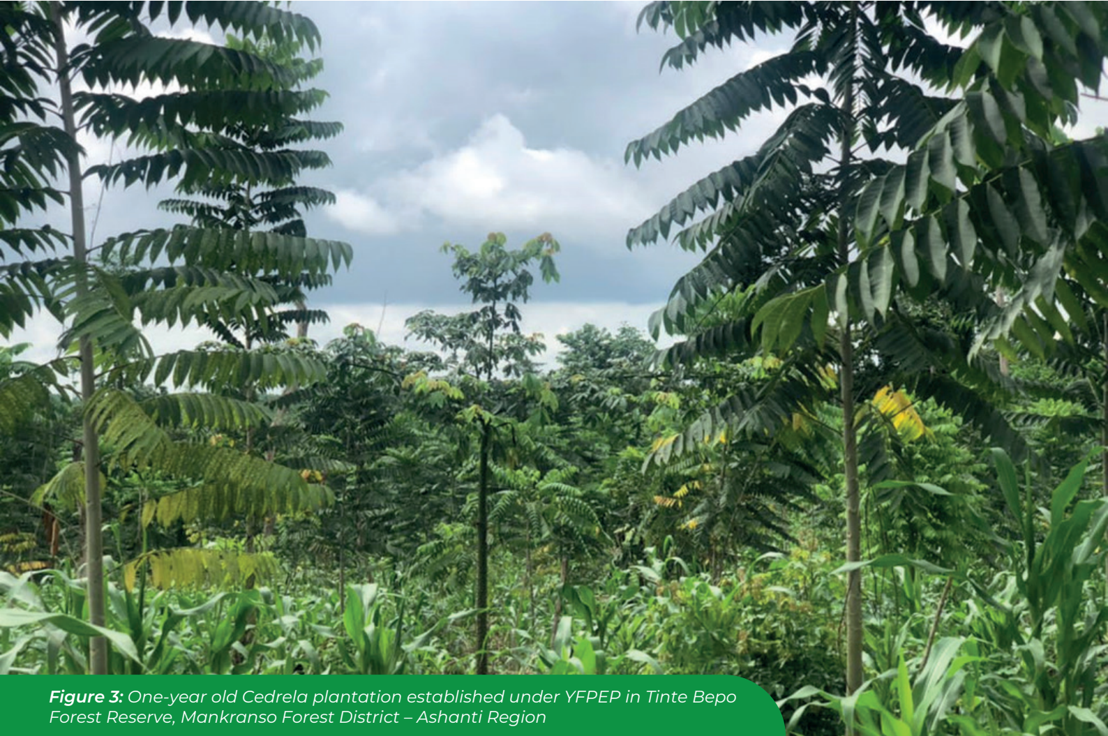
Figure 3: One-year old Cedrela plantation established under YFPEP in Tinte Bepo Forest Reserve, Mankranso Forest District – Ashanti Region