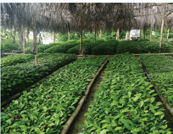
Figure 11: FSD Tree Nursery at the Asankragwa District Office – Western Region

Several indirect jobs such as food vending, transportation, construction and harvesting operations were created nationwide apart from the direct jobs that were created.