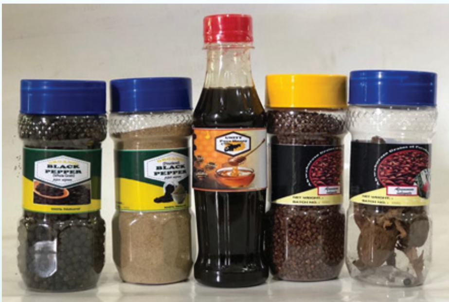
Figure 12: Products from the NWO-WOTRO project showcased at the Food & Business Research Final conference in the Netherlands.

Following its completion, some post project activities are being undertaken which are chalking considerable successes. During the year under review, monitoring of experimental plots of black pepper, honey and grains of paradise incorporated into MTS plantations in the Tano Offin and Asenanyo Forest Reserve respectively continued as part of post project activities aimed at learning lessons and using the information to finalize guidelines on the production of the three NTFPs in forest plantations. Monitoring and inspection of beehives was conducted in November, 2020. It was observed that three (3) out of ten (10) beehives mounted under Teak plantations had been colonized. Furthermore, two (2) mature beehives were harvested in December, 2020.