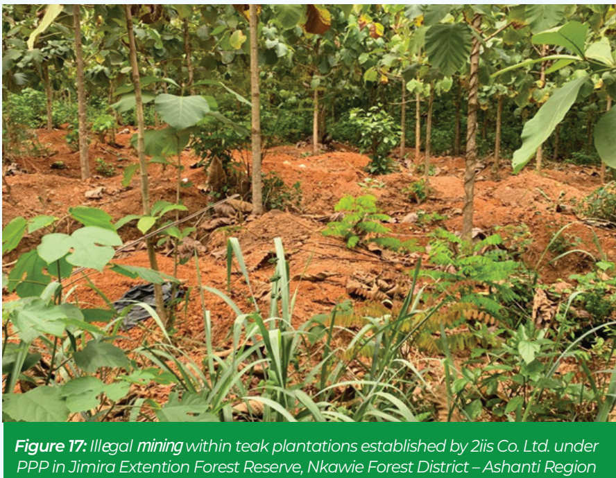
Figure 17: Illegal mining within teak plantations established by Ziis Co. Ltd. under PPP in Jimira Extension Forest Reserve, Nkwawie Forest District – Ashanti Region

The following additional challenges also affected operational activities during the reporting period: