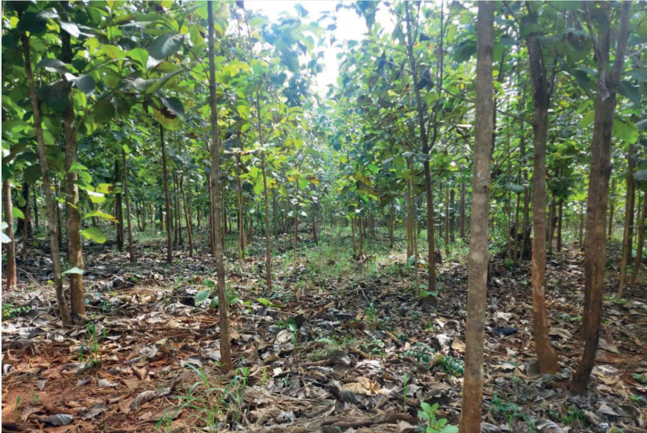
Figure 10: Coppice management of Teak stand undertaken by Messrs. Gentle Jesus Limited in Tain II Forest Reserve, Sunyani Forest District – Bono Region

In addition, FC is partnering with Messrs. Gentle Jesus Limited, Nsoatre and Dumasua Taungya Groups to undertake coppice management within portions of fifteen (15) compartments covering 1,065 ha within Tain II Forest Reserve. A total area of 71.1 ha of coppice management was undertaken under this partnership in 2020.