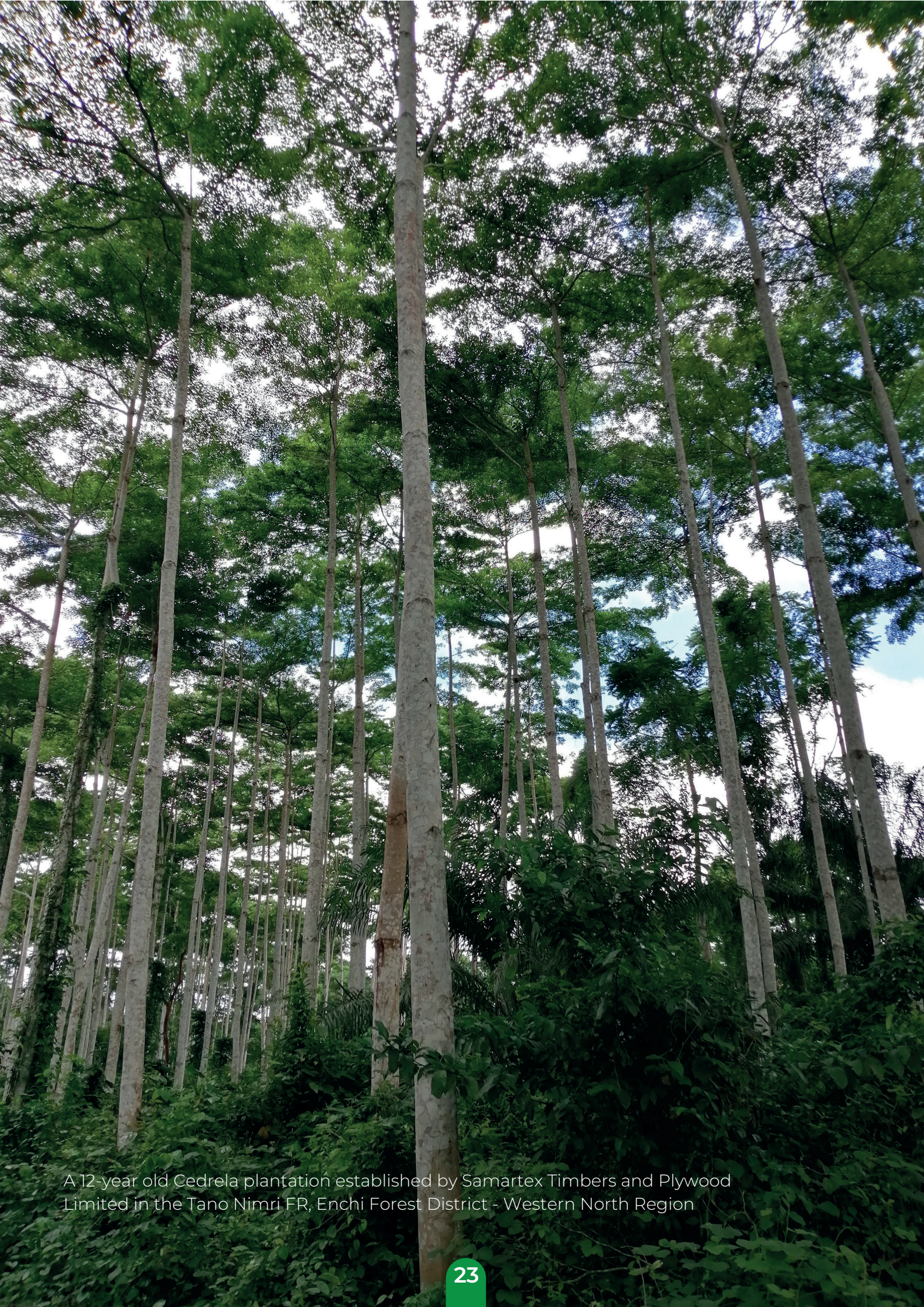
A 12-year old Cedrela plantation established by Samartex Timbers and Plywood Limited in the Tano Nimri FR, Enchi Forest District - Western North Region