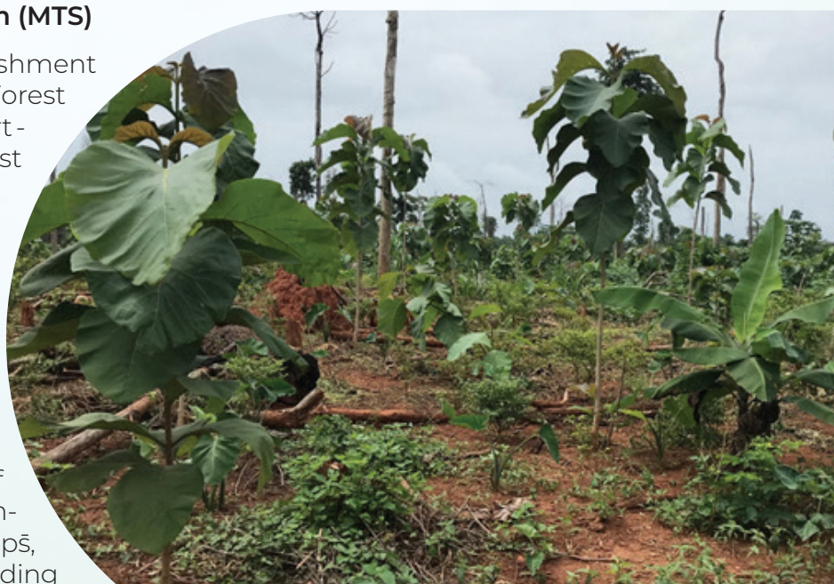
Figure 2: One-year old MTS Teak stand intercropped with plantain in Aparapi Shelterbelt Forest Reserve, Bechem Forest District – Ahafo Region

The MTS involves the establishment of forest plantations by the Forest Services Division (FSD) in partnership with farmers in forest fringe communities. Under the MTS, the farmers provide labour for the field activities while the FSD supervises and provides the required logistics. The farmers are permitted to cultivate their food crops alongside the planted trees on the same piece of land for a period of up to three (3) years. The farmers, in addition to the food crops, have a 40% share in the Standing Tree Value (STV) of the planted trees. The Government has a 40% share while the landowner and community have a 15% and 5% share respectively.