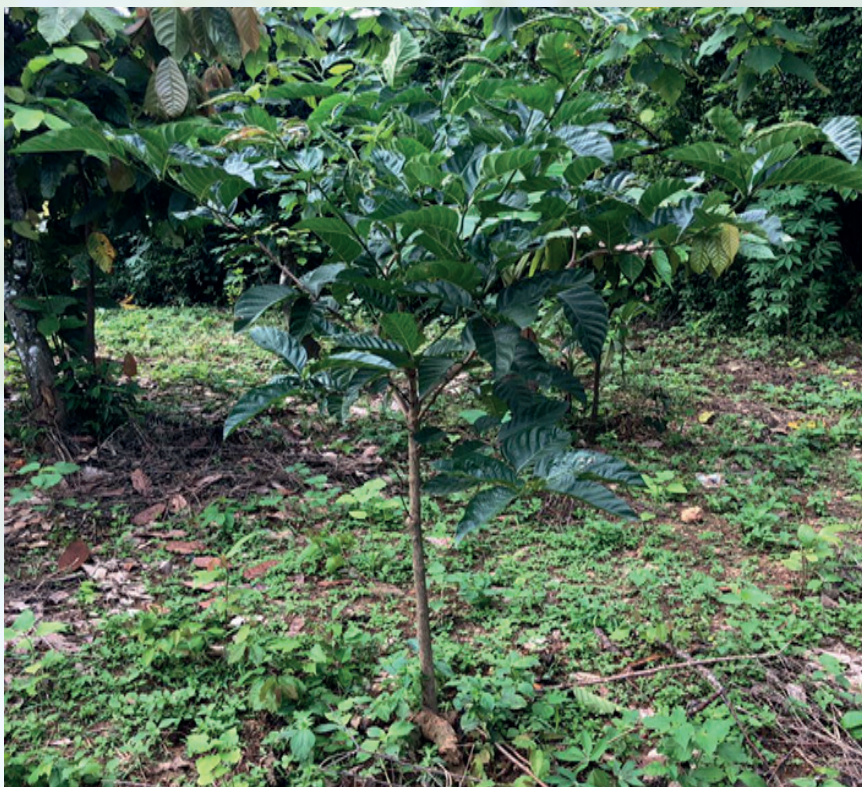
Figure 8: Konkroma seedling within a cocoa farm at Nimfuorkrom in Mankranso Forest District – Ashanti Region