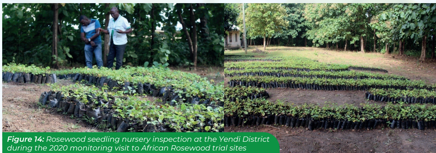
Figure 14: Rosewood seedling nursery inspection at the Yendi District during the 2020 monitoring visit to African Rosewood trial sites