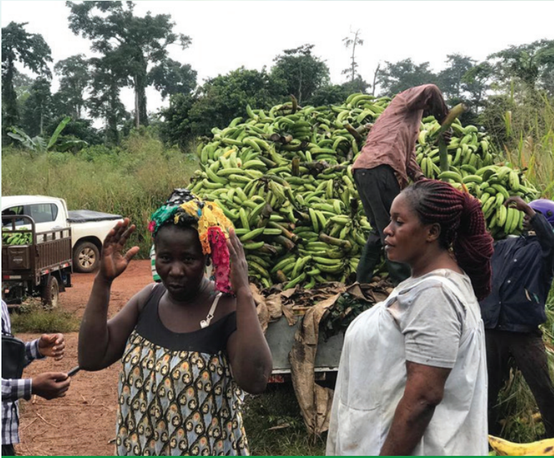
Figure 13: Plantain harvested from MTS stands within Ayum Forest Reserve, Goaso Forest District – Ahafo Region