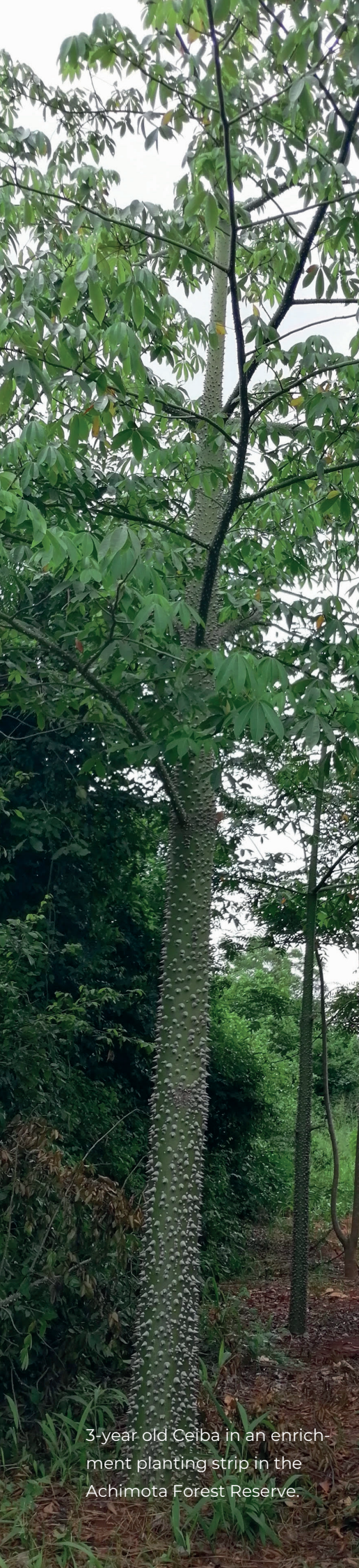
3-year old Ceiba in an enrichment planting strip in the Achimota Forest Reserve.