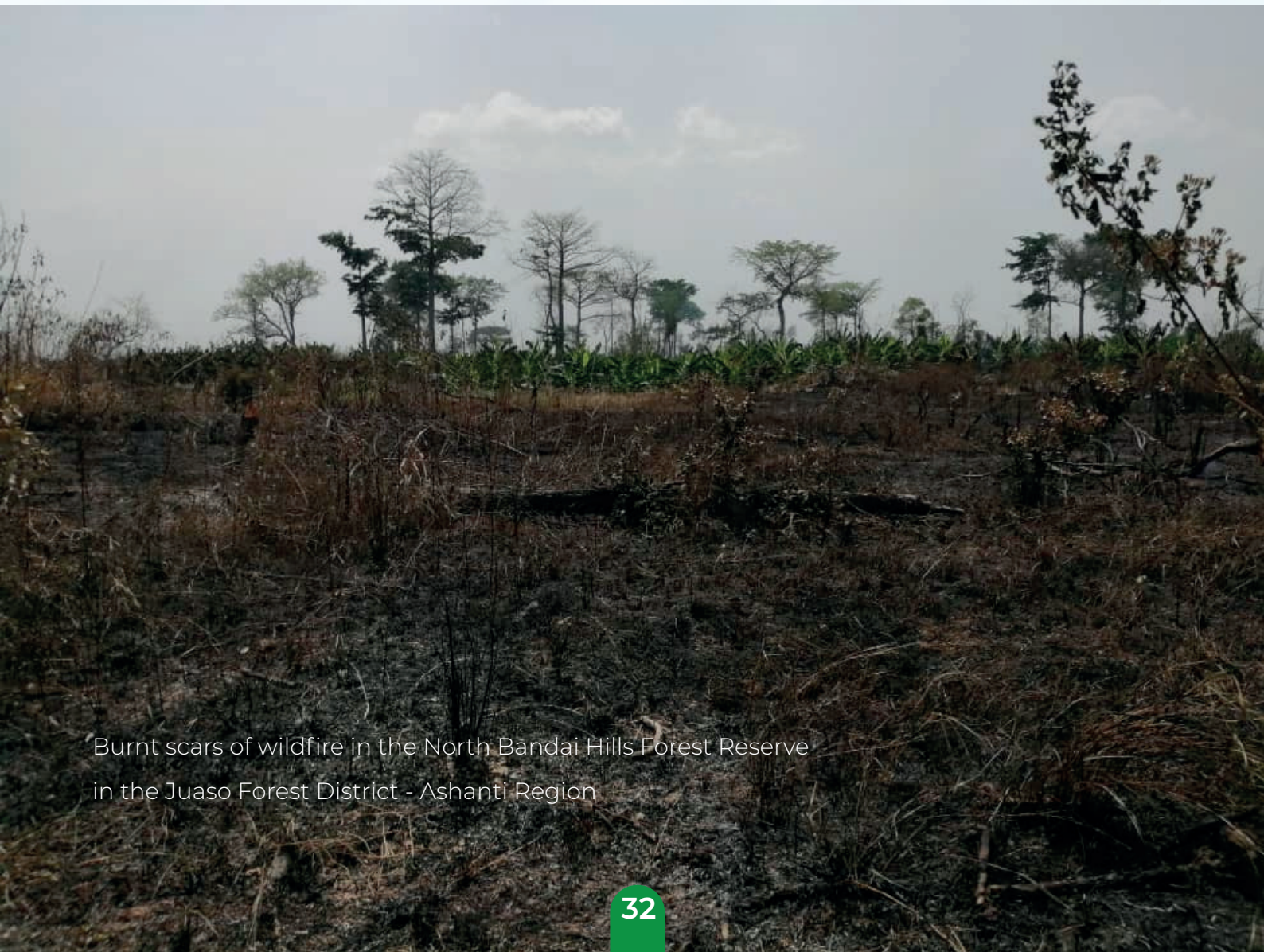
Burnt scars of wildfire in the North Bandai Hills Forest Reserve in the Juaso Forest District - Ashanti Region