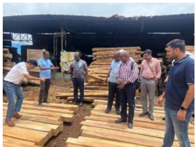
Fig. 9: The delegation and representatives from Vibrant Exim PVT Ltd. discussing the observed differences in quality between Teak imports from Ghana and Latin America