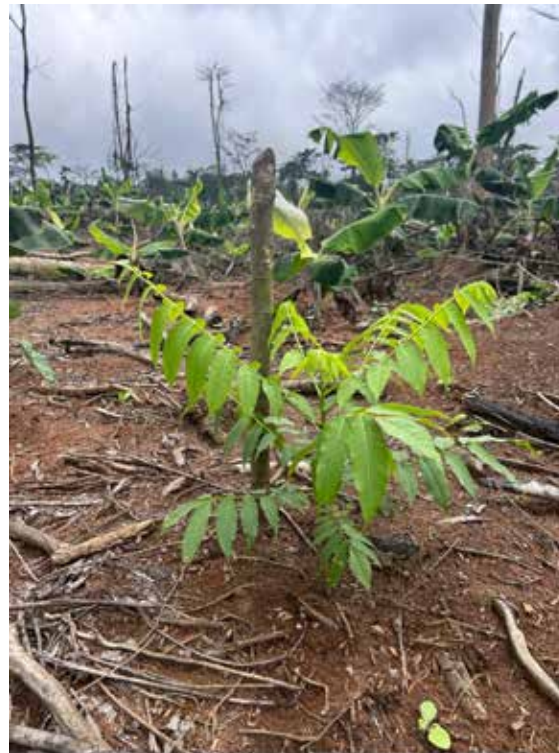
Fig. 2: One-month old Cedrela stand planted under MTS in the Southern Scarp Forest Reserve, Begoro Forest District - Eastern Region