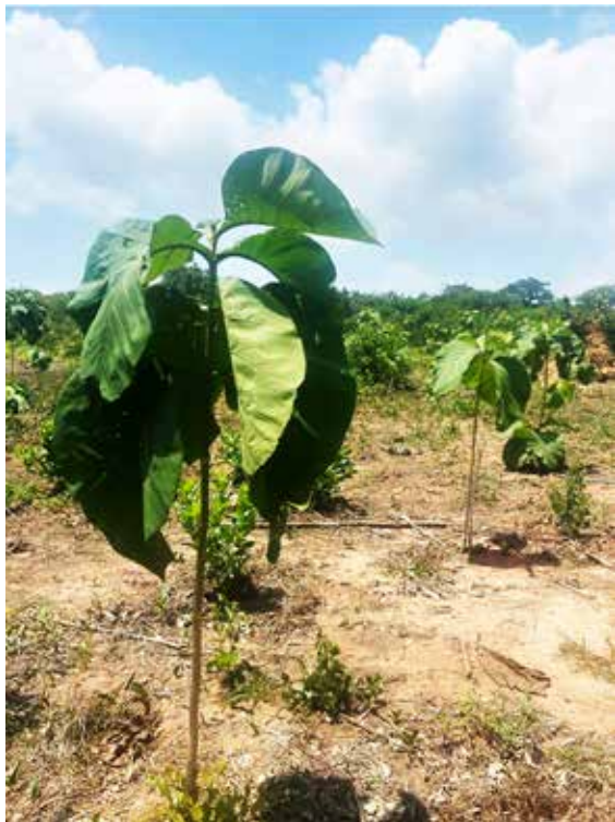
Fig. 1: Teak stand established under GLRSSMP at Adukrom off-reserve site in Donkorkrom Forest District, Eastern Region