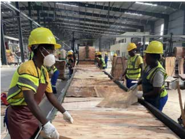
Fig. 14: Wood processing into plywood at Miro Forestry (Gh) Limited's Plymill at Drobonso in the Kumawu Forest District, Ashanti Region

The extracted volume comprised 168,382.6m 3 from on-reserve and the remaining 116,806.3m 3 from off-reserve areas. The volume of plantation timber harvested on-reserve saw a significant increase from 2021 (104,498.5m 3 ), 2022 (145,757.8m 3 ) and 2023 (168,382.6m 3 ). Plantation timber harvested off-reserve experienced a notable rise in volume; 99,493.4m 3 (2021) and 151,396.6m 3 (2022) but declined to 116,806.3m 3 (2023).