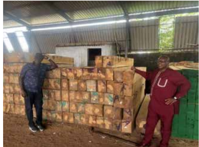
Fig. 13: Latin America Processed Teak at Jaypee Sawmill

industry. Additionally, huge imports of tropical and temperate species from both the global south and north is an approach adopted to augment the raw material base.