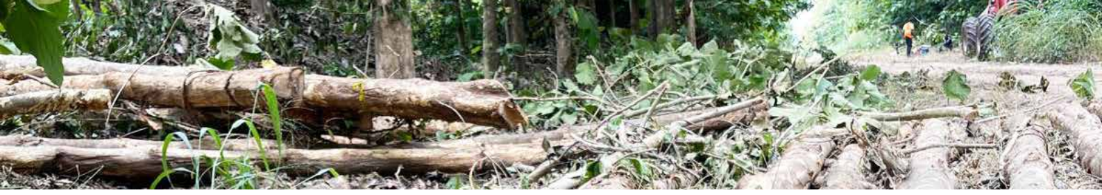
Table 17: Volume of Plantation Timber (m 3 ) harvested Off-reserve in 2023