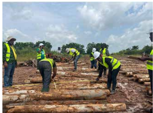
Fig. 15: Joint FSD/TIDD/RMSC team undertaking log measurements within the Boumfum Forest Reserve to develop tree volume - weight conversion factors of plantation tree species to facilitate volume determination using the Miro Forestry (Gh) Ltd.'s Weighbridge near Drobonso in the Kumawu Forest District, Ashanti Region

The details of on-reserve plantation timber production in 2023 have been provided in Table 16. Out of the total volume harvested on-reserve, Teak contributed 51.6% of total harvested volume, Eucalyptus (14.6%), Cedrela (11.0%), Gmelina (9.6%), and other species (13.2%).