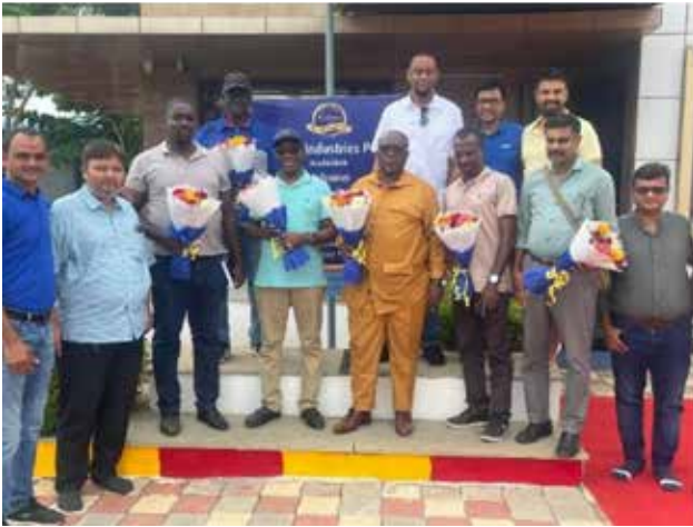
Fig. 12: The delegation at Ramhans Industries PVT Limited

The team sought to learn how the Vietnamese timber industry had evolved from mainly secondary production of timber products, as pertains in Ghana currently, to such a multi-billion ($16 Billion USD in 2022) industry in less than three decades. This started in 1995 when trade was first liberalised, following the lifting of USA trade embargo on Vietnam. The delegation met with trade associations, private sector operators, and visited mills and furniture production sites to learn at first-hand the industry's transformation over a short period of time.