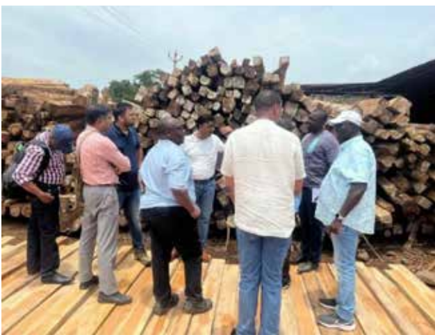
Fig. 8: The delegation inspecting imported Teak billets from Ghana and clean square processed lumber imported from Brazil at Vibrant Exim PVT Limited.

It was advised that in order for Ghana Teak to remain competitive and not lose the market share despite the desirable quality in density, Ghana needs to ensure that Teak plantations are mature before harvesting, with improved silvicultural practices in Teak stand management that gives priority to straight boles and optimal merchantable diameter.