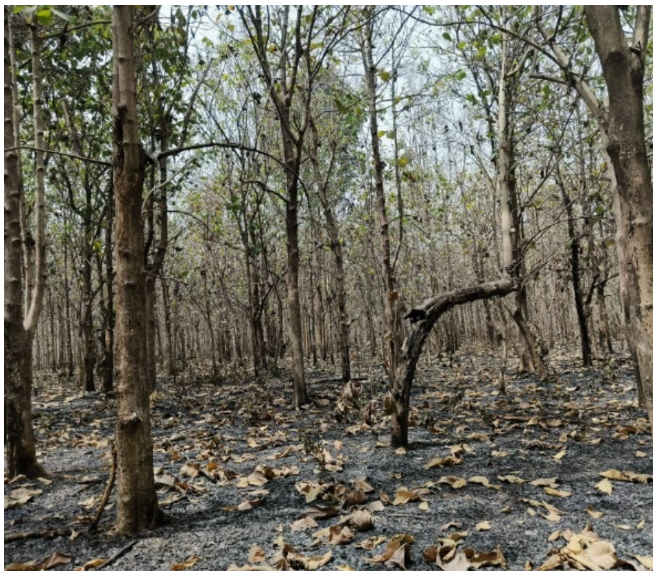
Fig. 5: Incidence of wildfire in portions of Teak plantations in the Opro River Forest Reserve, Offinso Forest District

Figure 6 shows the nationwide trend of wildfire incidences as reported from 2019 to 2023. The regional breakdown of fire occurrences within plantations in forest reserves is been presented in Table 11.