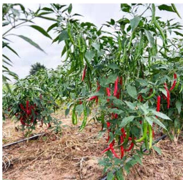
Fig. 4: Plantain (left) and Pepper (right) produced from The Apostolic Church - Ghana's reforestation area within the Bandai Hills Forest Reserve in the Juaso Forest District, Ashanti Region