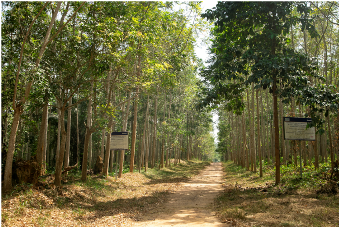
Fig. 7: 10-year old Cedrela and Indigenous species planted within Newmont Golden Ridge Limited's Reforestation Offset site at Kwekaru Forest Reserve, Kade Forest District - Eastern Region