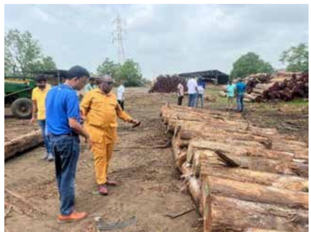
Fig. 11: Teak billets from Brazil at Shyam Timber/ Vandana Timber PVT Limited