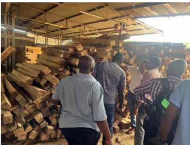
Fig. 10: Inspection of processed Teak at Shree Maruti Enterprise